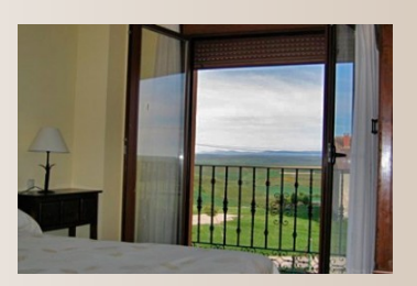
You can book the accommodations in this guide in JUST ONE STEP